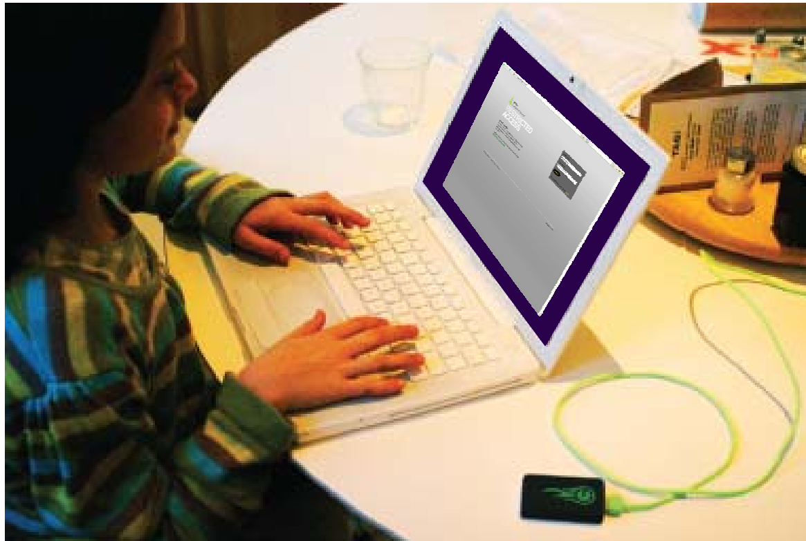
She logs onto her account...