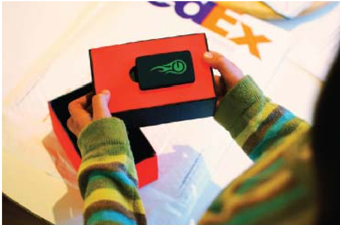
A week later, she's opening the box.