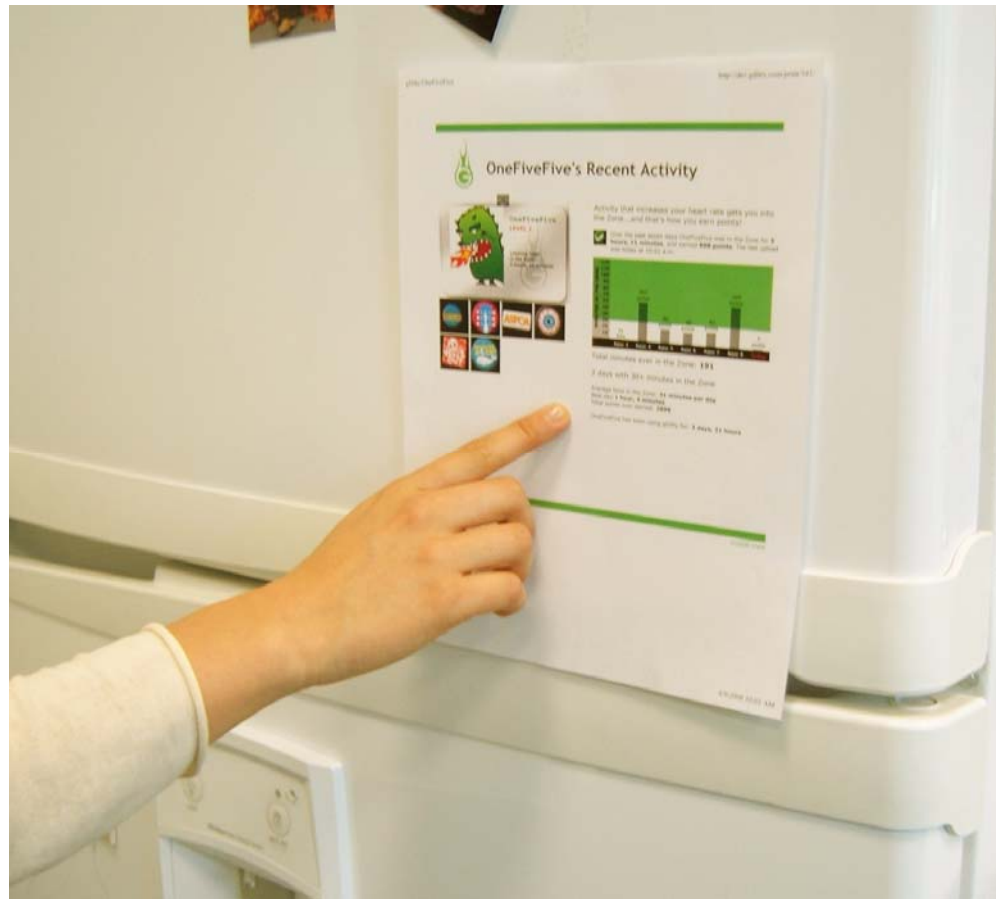
She's proud to show her mom.